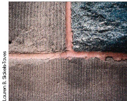
Lauren B. Sichel/Taves

To supplement visual examination, one can analyze the composition of the existing mortar. These analyses range from simple on-site tests to laboratory studies—all in an effort to determine the type of binder and aggregate originally used.