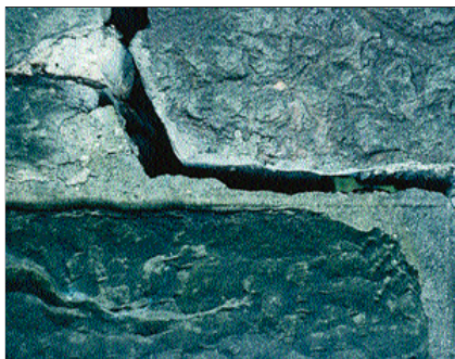
Lauren B. Sickels-Taves

The mortar used here is not stronger than the material to which it adheres, making repointing easier.