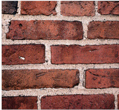
Lauren B. Sickels-Taves

The mortar used here is not stronger than the material to which it adheres, making repointing easier.