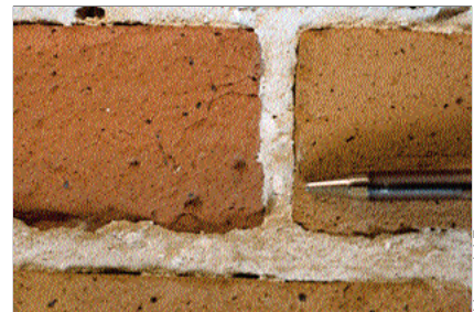
Henry V. Taves

Only recently has the use of lime as the sole binder made a comeback, as the preservation movement gains ground. Hydrated lime generally is used for restoration; however, when early strength is required, hydraulic lime may be added (in lieu of portland cement).